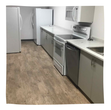
Kersley Community Association $13,000.00