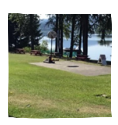
Royal Canadian Legion Branch #94 $20,000.00