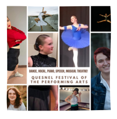
Quesnel Festival of the Performing Arts $2,500.00