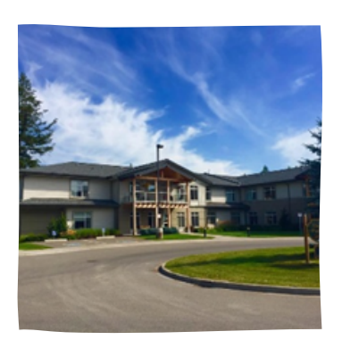
Quesnel & District Hospice & Palliative Care $8,600.00