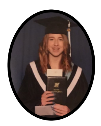
Nicole Proudfoot Gorsline Family Bursary $1,900.00