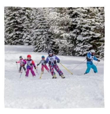
Lightening Creek Ski Club $5,500.00