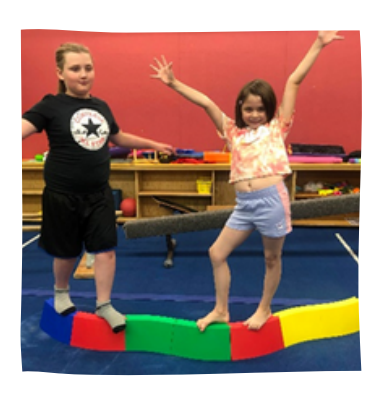
Quesnel Technics Gymnastics $8,000.00