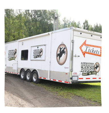
Quesnel Rodeo Club $10,000.00