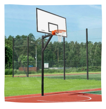
North Cariboo Christian School $750.00