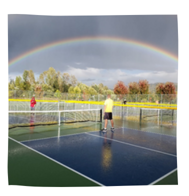
Quesnel Pickleball Club $10,000.00

Without continual growth and progress, such words as improvement, achievement and success have no meaning.