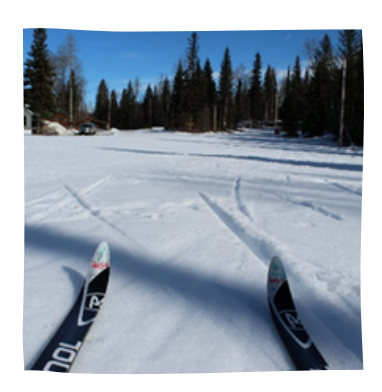
Cariboo Ski-Touring Club $13,000.00