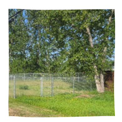
Baker Creek Enhancement Society $8,000.00 & $2000.00 Holger Bauer